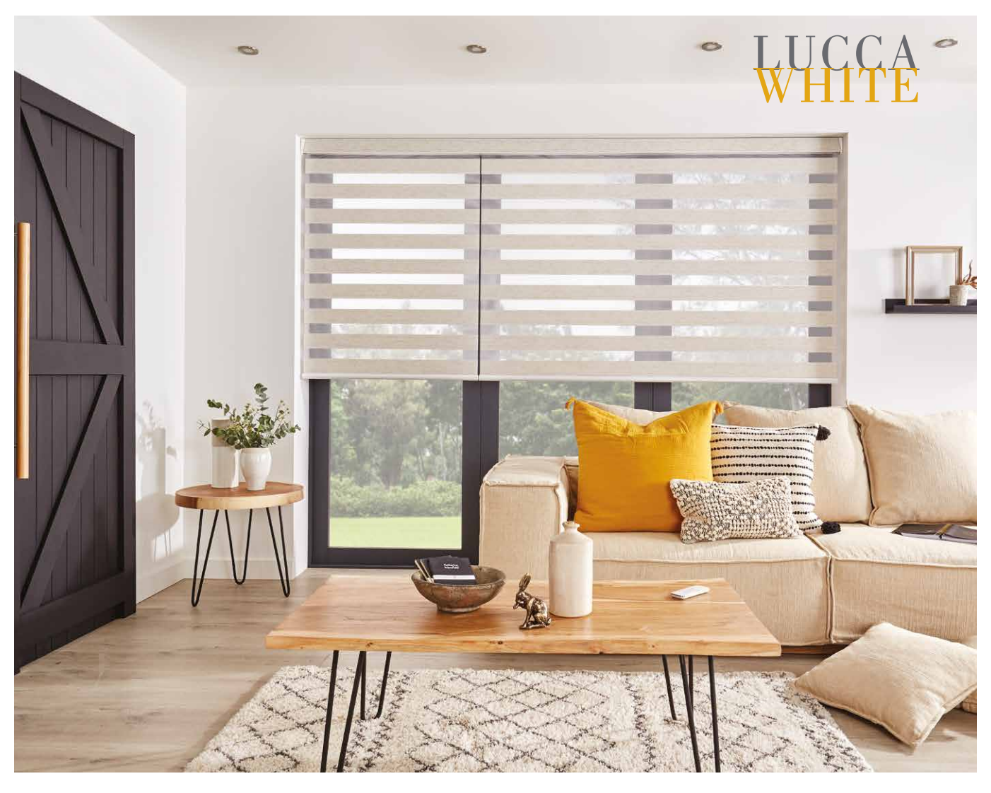
PLEASE NOTE: Blackout fabric does not create a fully blackout blind because there will be lightstrike at the edge of the blind and between the fabric vanes.

Vision blinds are an innovative window furnishing that feature two layers of translucent and opaque horizontal striped fabric that combine to create a striking modern feel. Our made to measure collection offers you the perfect range of fabrics and colours to help you to create your statement look.